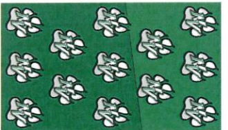
Elementary School (4 Windows)

Handwritten notes: "Element School" and "High School" in blue ink.